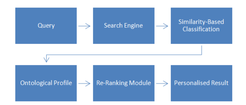
Figure 3: Personalised Web Search Based on Ontological User Profiles (Sieg Et Al.)